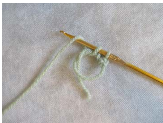
11. Proceed with a few single crochets (sc) as follows: *Insert hook in "Slip Loop", yoh, draw loop through "Slip Loop"; yoh, draw through 2 loops on hook.