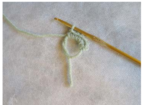
12. Here are 6 completed single crochets (6 sc).