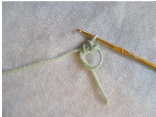
9. Draw yarn through 2 loops on hook.