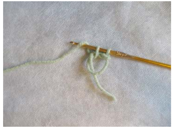
8. Yarn over hook (yoh).