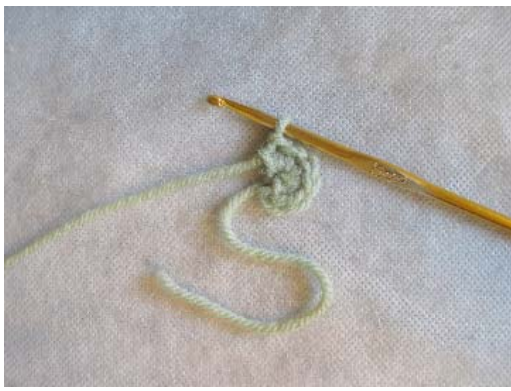
13. Firmly pull tail snug.