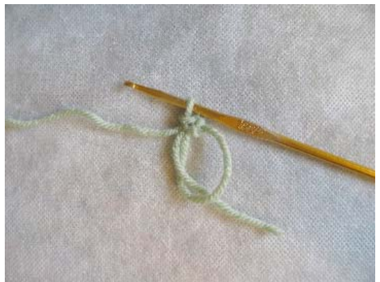
10. Snug stitch on hook (no new step).