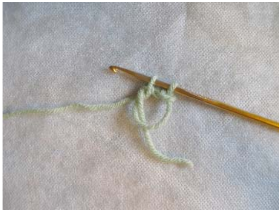
7. Draw loop through "Slip Loop".