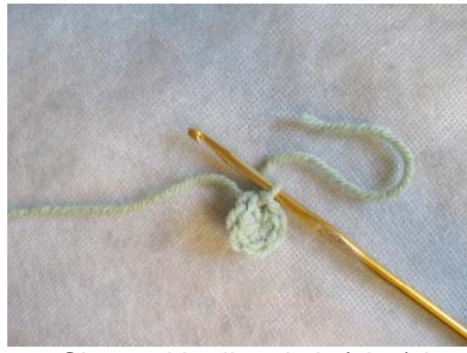
14. Close with slip stitch (sl st) in first single crochet (sc).